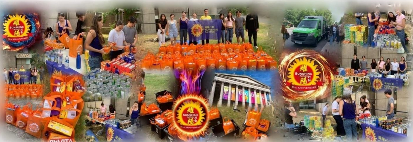
Sunshine Action at UCL University College London, UK